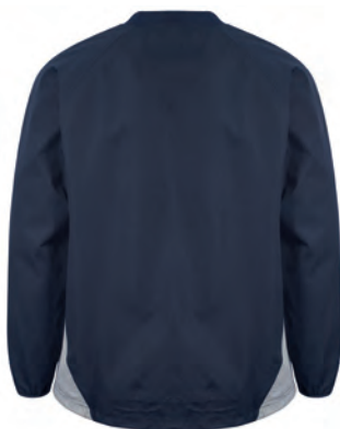
BACK NAVY SILVER